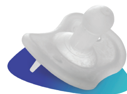
Newborn 2 to 6 kg