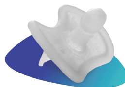
Premature baby 1 to 2 kg